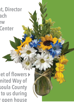
▶ Bouquet of flowers from United Way of Missoula County brought to us during our open house