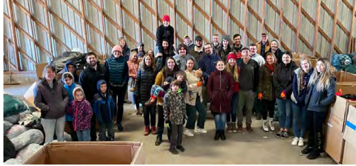
◀ Volunteers at the baling operation

In the Fall of 2021, it became pretty clear that the limited space for offices at our Hope Thrift Boutique was not going to be sufficient to house our entire leadership team long-term. We had done the best we could with the limited availability we had, but we were rapidly outgrowing our space and with the amount of donations coming through the doors at the Boutique, that limited space was needed to expand the thrift store floor and donation storage.