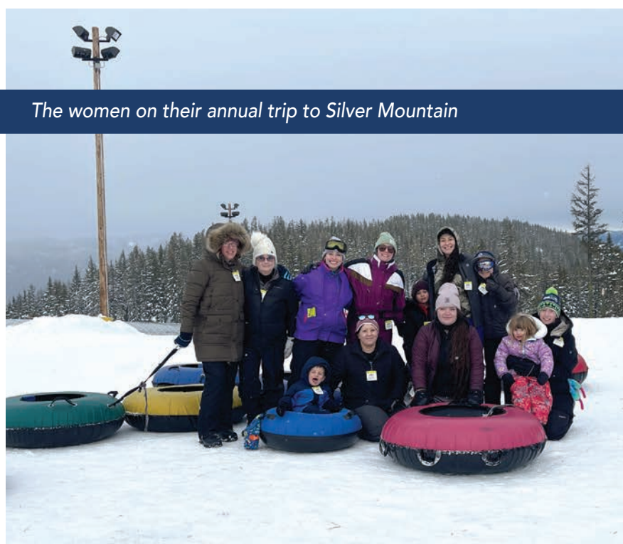
The women on their annual trip to Silver Mountain

These are just some of the many ways our team has helped give hope to those in urgent need this year, while also leaning on Jesus for insight! As we expect numbers to rise in the coming months, would you prayerfully consider financially partnering with our Drop-In Center? To partner with us, you can go to our website and give directly to our Drop-In Center where 100% of donations go to our clients!